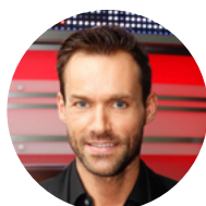
Sven Hannawald Ski jumping legend, Olympic Champion, World Champion