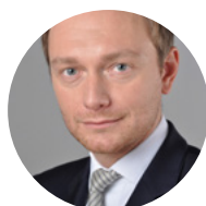
Christian Lindner MdB Leader of the parliamentary group of Germany's FDP liberal party