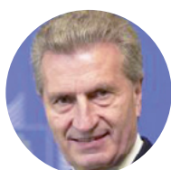
Günther Oettinger Former EU Commissioner