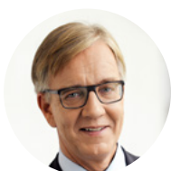
Dr Dietmar Bartsch MdB Co-leader of the parliamentary group of The German Left Party