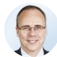
Peter Beuth Hessian Minister of the Interior and Sports