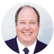
Prof. Dr Helge Braun MdB Head of the Federal Chancellery