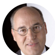
Dr Gregor Gysi MdB Lawyer and politician, Member of Parliament for The German Left Party