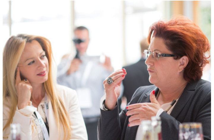
Photographs of the German Economic Summit